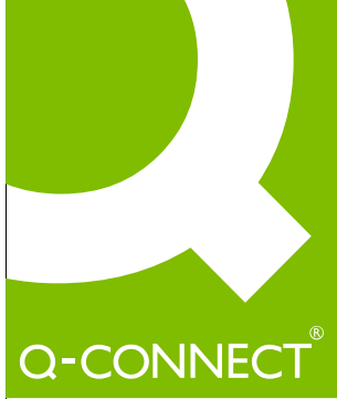
PHOTO PAPER A4, HIGH-GLOSS, 260GSM