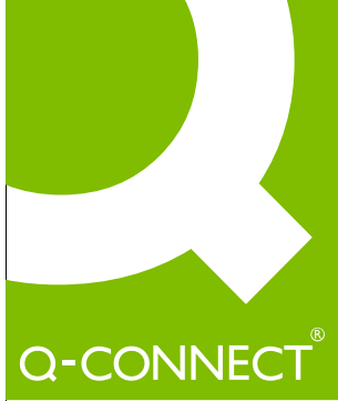
PHOTO PAPER A4, GLOSSY, 180GSM