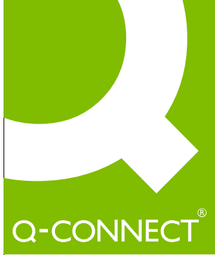
PHOTO PAPER A4, SOFT-GLOSS, 218GSM